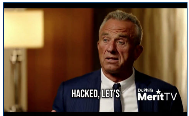
347 Robert F. Kennedy, Jr. on Dr. Phil's Merit TV: "Everybody knows any machine can be hacked." "You need something to check the election. And that's what we should be talking about rather than did this one get hacked or did that one?" "And you need paper ballots" Perma.cc/H3UC-LA64