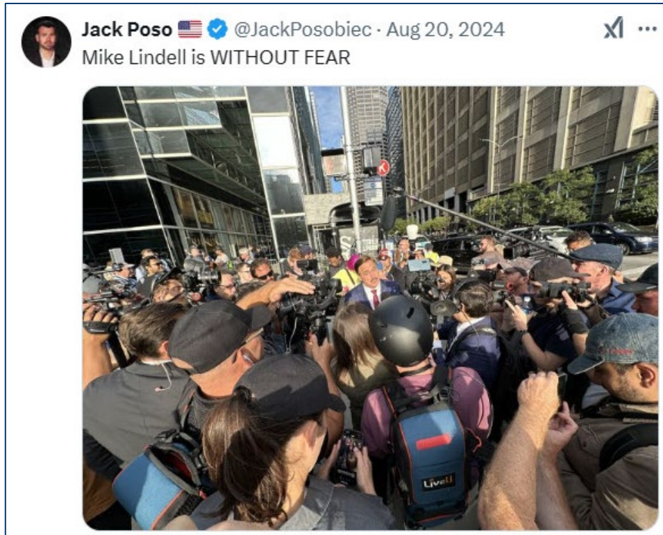
348 Jack Posobiec photo from Democratic National Convention showing Mike Lindell on the street amongst protesters, answering questions from the media. Perma.cc/77EN-ZSG8

Jack Posobiec caught a great picture of an example of Mike Lindell’s fearlessness – stepping into a crowd of protesters and media at the DNC Conference to spread his message.