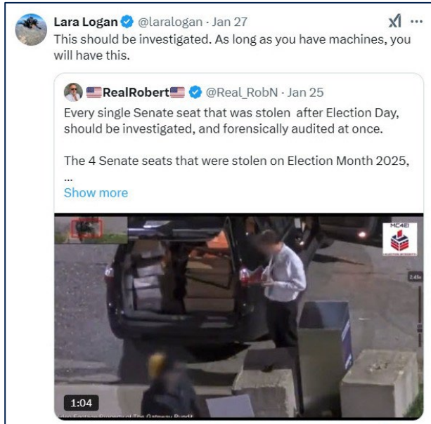
344 Lara Logan: "This should be investigated. As long as you have machines, you will have this [stolen elections]. Perma.cc/5E4C-552K

Mike Lindell has never been alone in this battle. There are others: